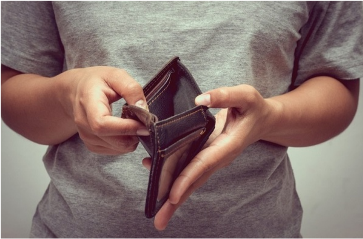
These 20 Everyday Habits Might Be Making You Broke