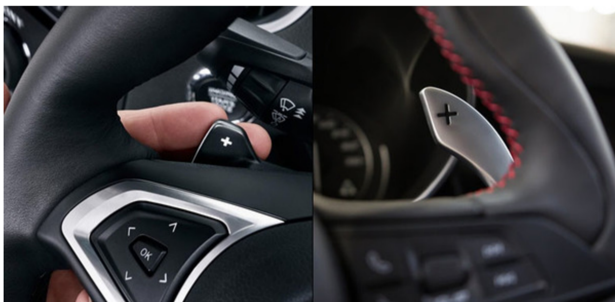
Does The Paddle Shift In Automatic Cars Serve Any Useful Purpose?