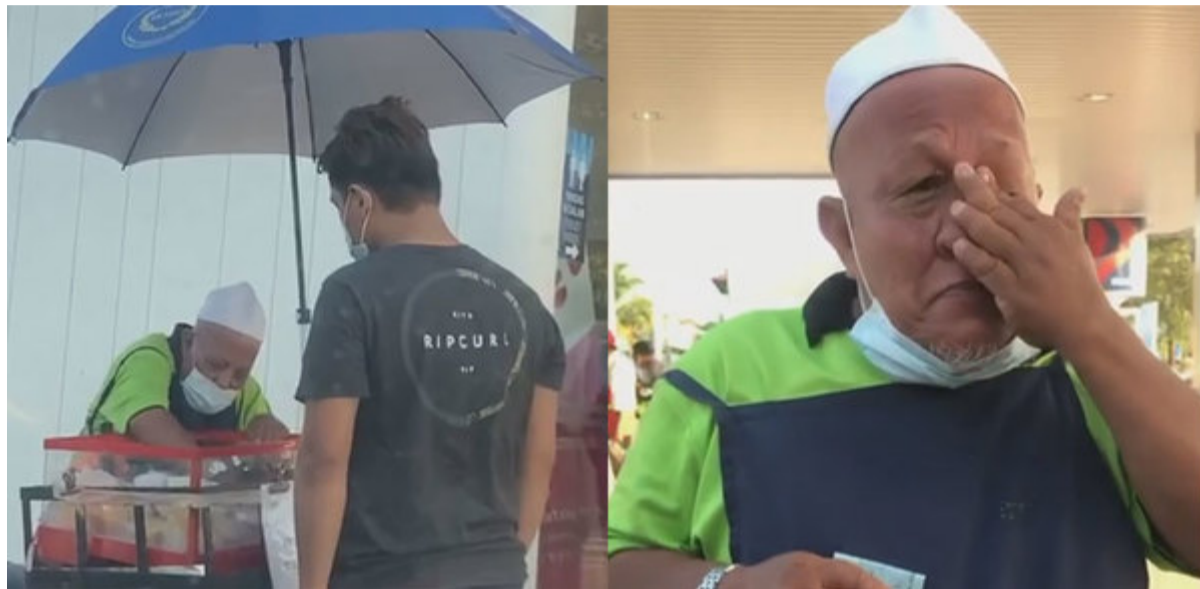
Fruit Stall Pak Cik Breaks Down In Tears After Couple Buys Out All His Stock