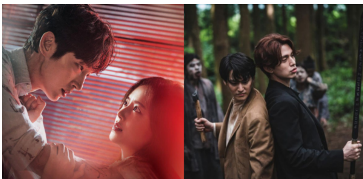
29 Must-Watch K-Dramas From 2020 That You Should Totally Check Out If You Haven't Already