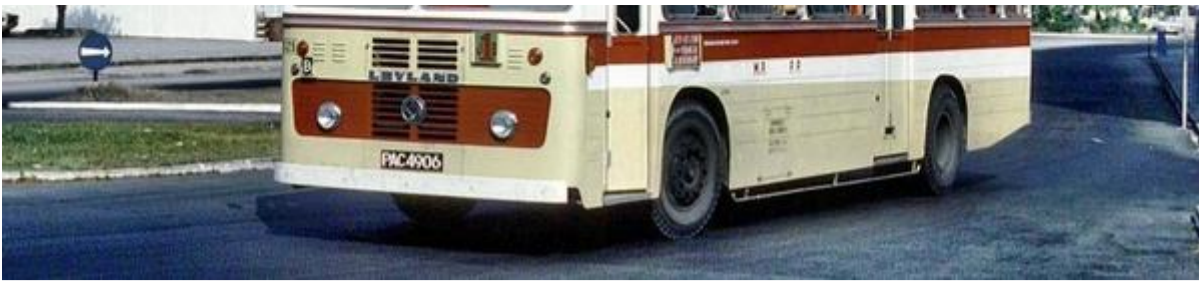
These Photos Of Buses That Have Disappeared From The Penang Roads Are GOLD